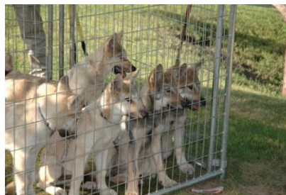
And they just ate!