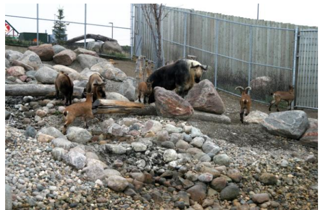
Takin & tur together