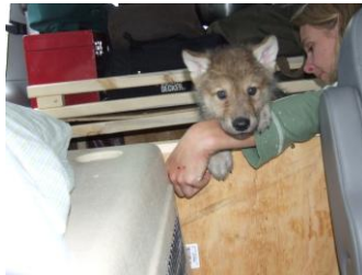
It was perfect for the trip – very comfortable for us and plenty of room for the pups.