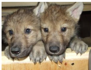
Is it our turn to eat yet?

In the back of the van we built a large wooden box for all the pups and supposedly enough room for one of us to be in with them. The trip back included some interesting moments. Imagine seven pups in the back of a van needing to eat every five hours from a bottle.