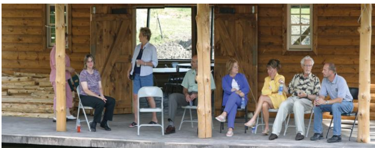
They need rocking chairs, don't you think?

"Live simply. Love generously. Care deeply. Speak kindly. Leave the rest to God."