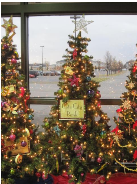
Gate City Bank