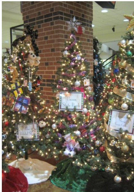
Union State Bank