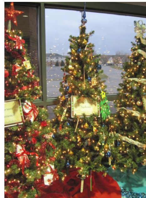
Liberty Business Systems