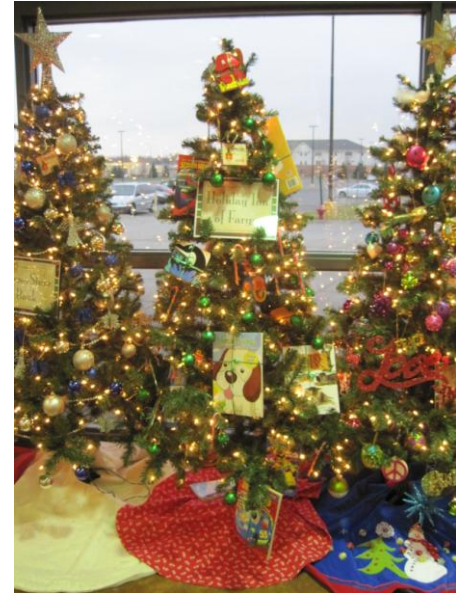
Holiday Inn of Fargo