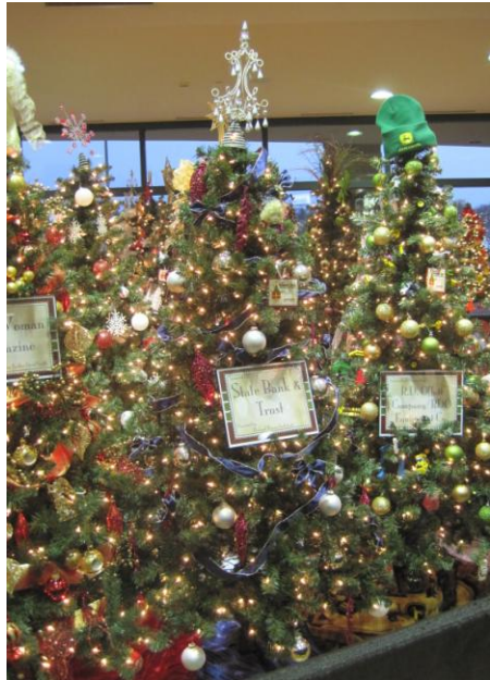
State Bank & Trust