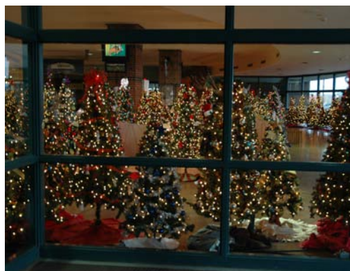
View through the window

If you have the opportunity to take your family to the Fargodome, do so. It's a fun fantasy-land of trees. It's free to get in and you don't have to pay for parking.