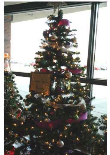
Union State Bank