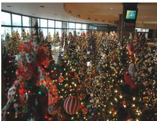
Beautiful trees everywhere!