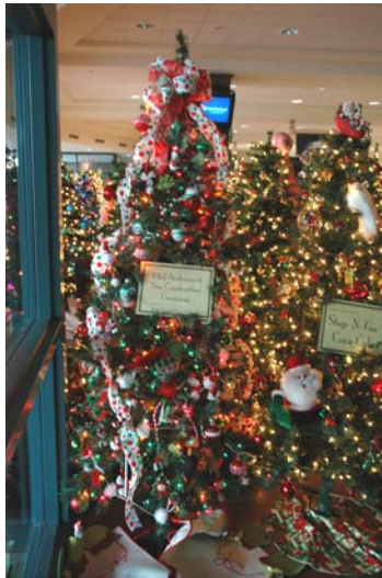
Olaf Anderson & Sons