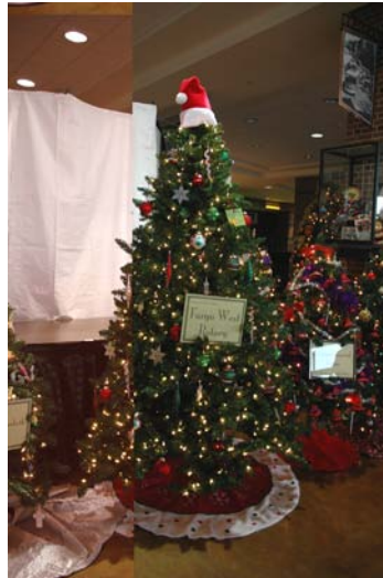
Fargo West Rotary