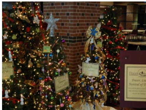
Liberty Business Systems