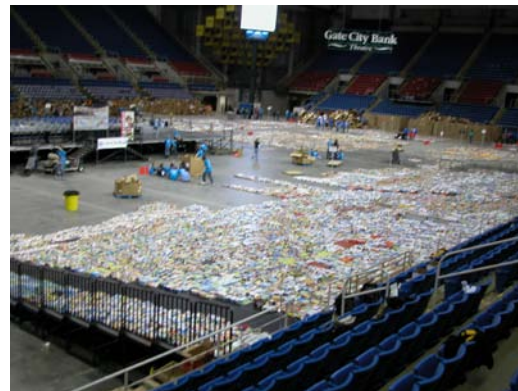
The floor of the dome a week before the deadline.