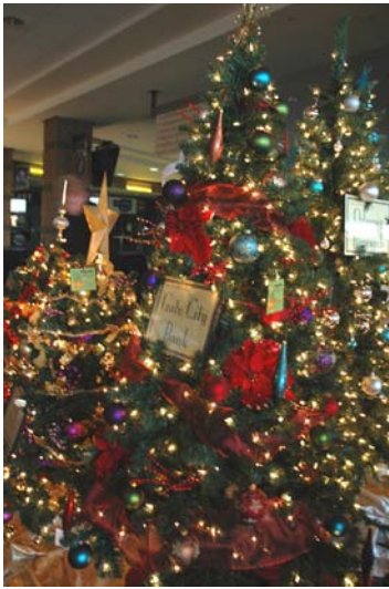
Gate City Bank