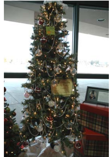
Bernie's Wine & Liquors