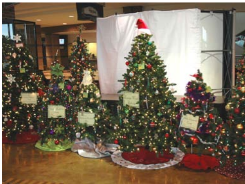
Fargo West Rotary tree with friends