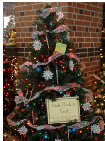
State Bank & Trust