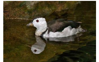
Cotton Pygmy Goose

There is more information to come on motorcycle runs/rides to benefit the Zoo and The Miracle League.