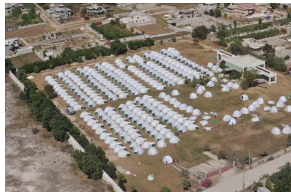
Arial picture of Congress Camp in Haiti where 400 ShelterBox tents have been set up.

ShelterBoxes rely on individual donations. So far, 65,700 have been donated since January, 2001. The program is the brain child of a Rotarian in England. You can read about the history of the program here http://www.shelterbox.org/about.php?page=11